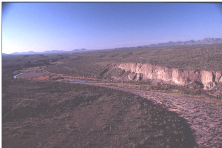
Figure 3. Bartlett BA. Maricopa County, Arizona.

Observation Period. – February 10 to May 25. Total monitoring 77 days/781 hours.