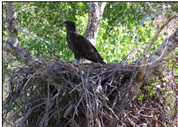
Figure 2. Nestling at newly discovered Yellow Cliffs BA, Maricopa County, Arizona.

Significant findings of the 2006 nest survey include: 3 new bald eagle BAs, 6 new alternate bald eagle nests and 1 fallen nest within BAs, 1 new large nest in a historic breeding area, 2 new large nests in new locations, and 1 new BA in California near the Arizona border.