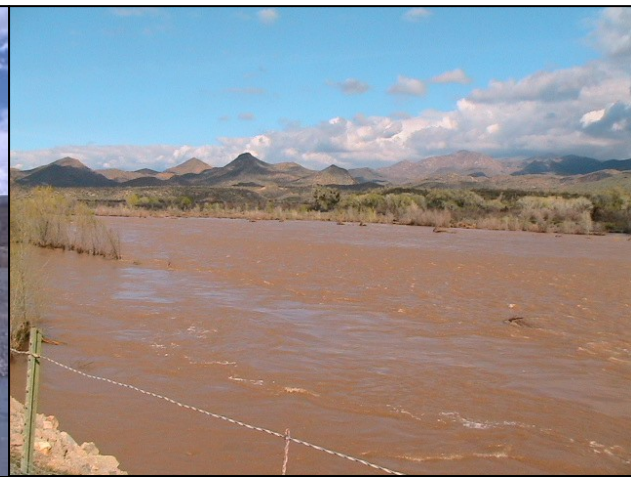
Figure 5. Box Bar BA during floods of February 2005. Maricopa County, Arizona.

Observation Period. – February 10 to April 30. Total monitoring 89 days/521 hours.