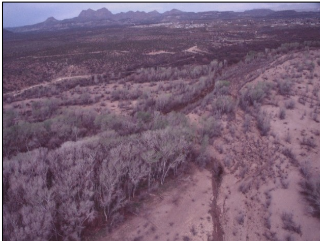
Figure 12. San Carlos BA. Gila County, Arizona.

Bald Eagle Identification. – The male is blue VID banded “11/E” on his left leg, USFWS banded on the right leg, and in adult plumage (2000 Doka nestling). The female is purple VID banded on her left leg, USFWS banded on the right leg, and in adult plumage (probably the 1989 Bartlett nestling).