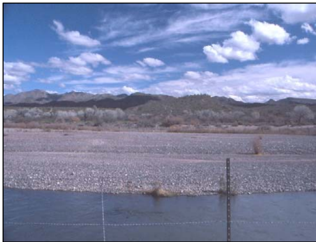
Figure 4. Box Bar BA in 1999. Maricopa County, Arizona.