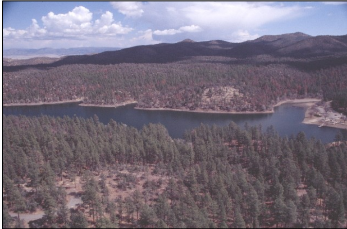
Figure 7. Lynx BA. Yavapai County, Arizona.

Observation Period. – March 24 to May 5. Total monitoring 30 days/560 hours.